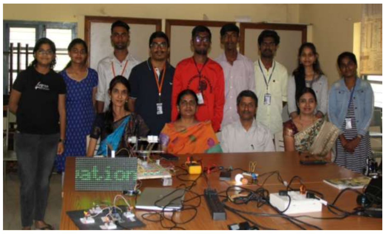
With all the participants